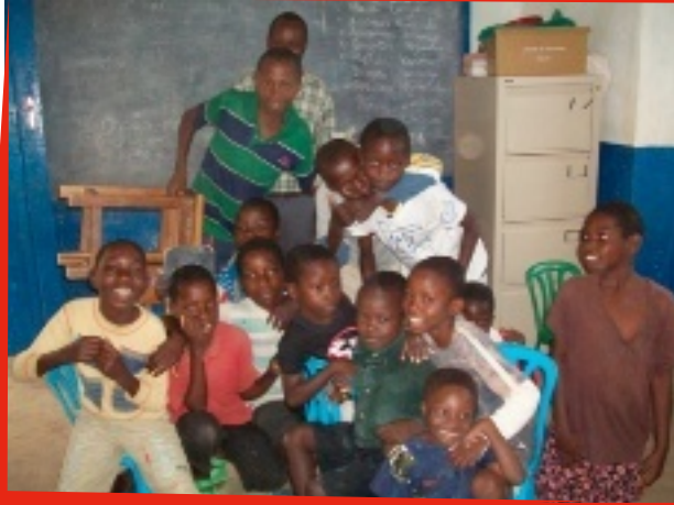
Children from the school for the deaf at Bandawe