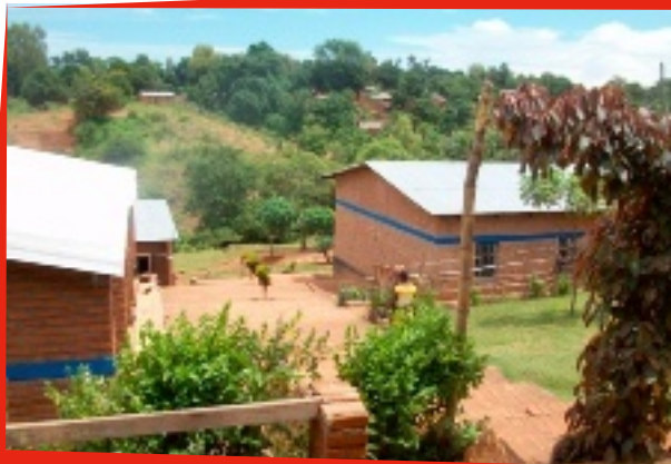
Kunyanja School in bloom