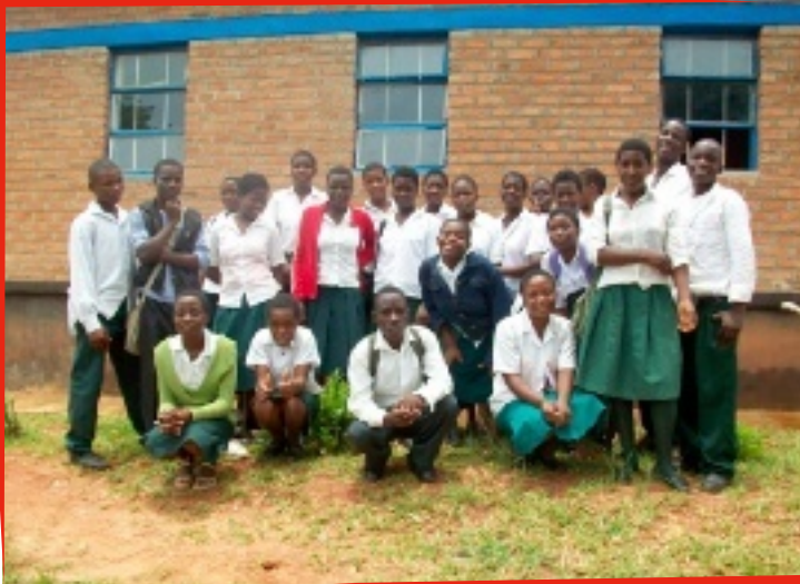
The scholarship students