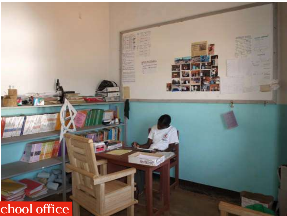
The school office

Now there are 250 students the admin is much more complex! The books bought with Masambiro support have made a massive difference to the school.