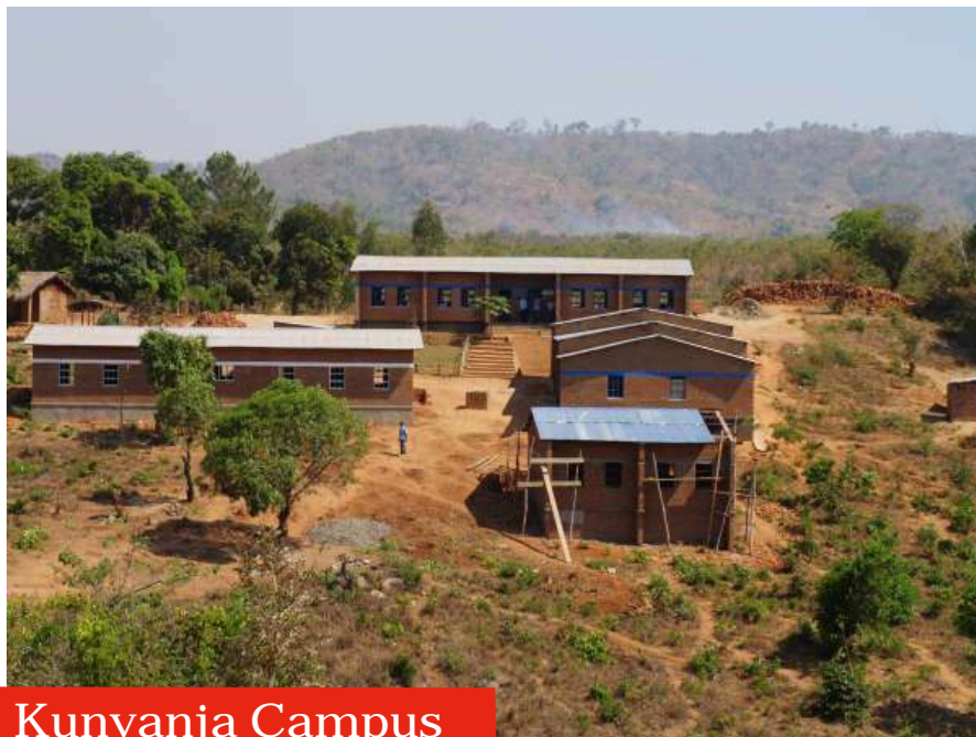
The Kunyanja Campus

But for now the message from the teachers and students is a huge thank you and appreciation that so many people in the UK have taken an interest in their future.