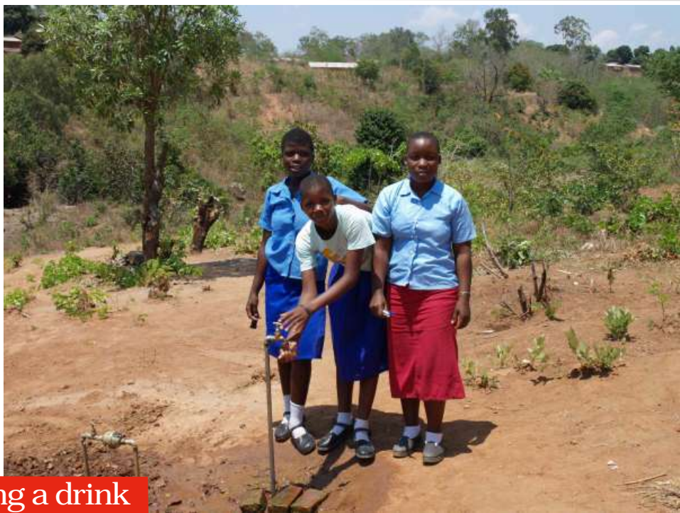
Having a drink

Bringing water from the town to the school has also brought water to local villagers.