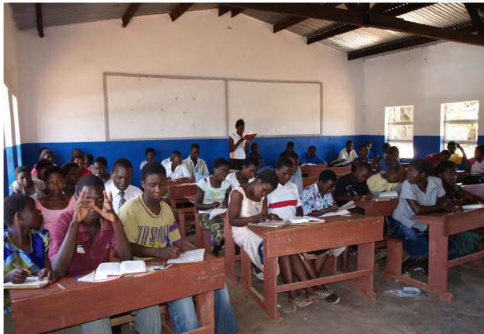
Studying hard – each classroom holds about 60 students