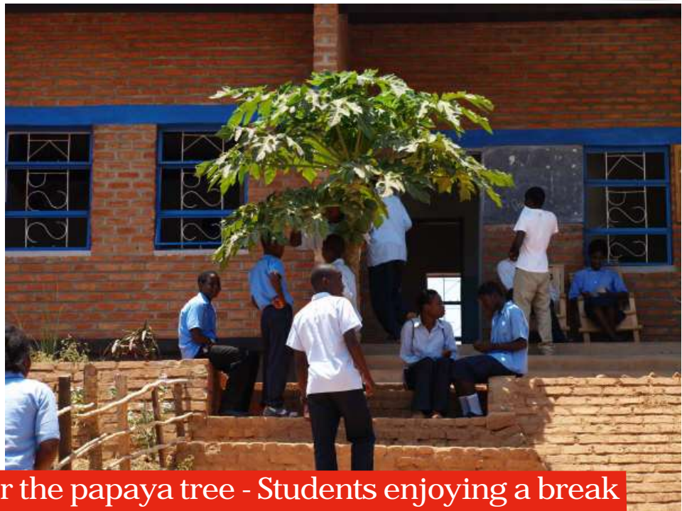
Under the papaya tree - Students enjoying a break